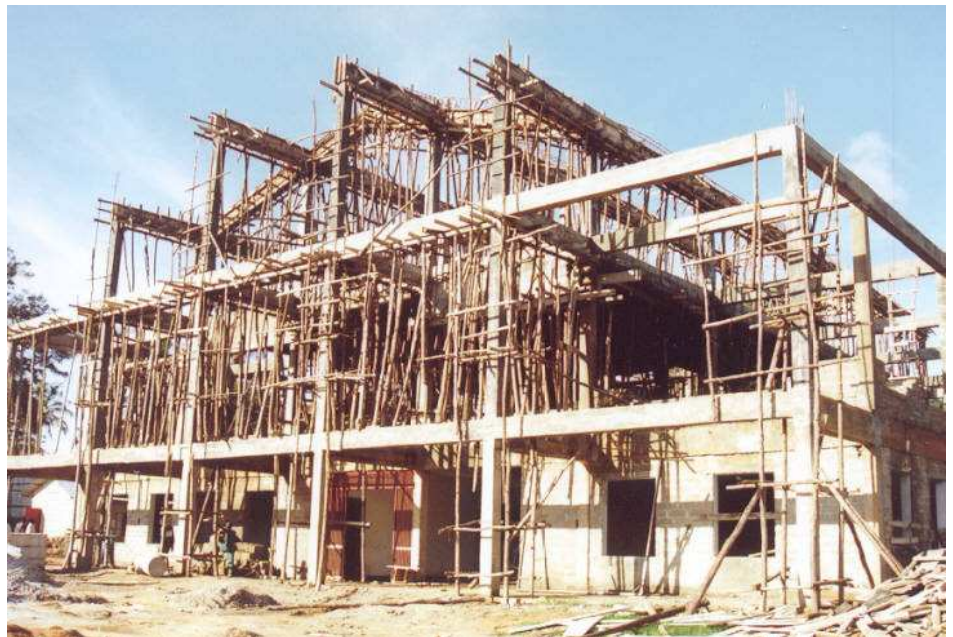
The new campus building of Kisubi Brothers University Center nears completion. It is expected to be ready soon.